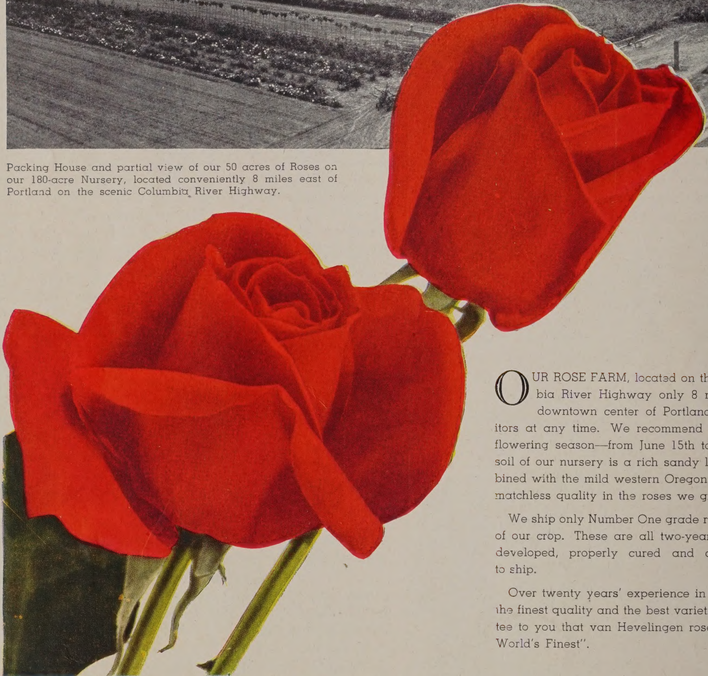
ROME GLORY—$1.50 each; 3 for $3.75 (Patent No. 304)

O UR ROSE FARM, located on the famous Columbia River Highway only 8 miles east of the downtown center of Portland, is open to visitors at any time. We recommend visits during the flowering season—from June 15th to October 1. The soil of our nursery is a rich sandy loam, which combined with the mild western Oregon climate makes a matchless quality in the roses we grow.